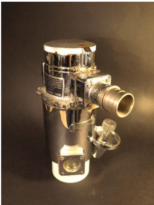
Figure 8. Oxford Miniature Vapouriser

The OMV does not have a mechanical temperature compensation device but does have a heat sink containing antifreeze to allow its use in winter field conditions. Constant topping up of the vapour chamber with fresh anaesthetic at room temperature also helps to compensate for the drop in temperature due to vapourisation. If used with halothane the OMV's dial may become stiff due to build up of thymol. This is easily taken care of by filling the vapour chamber with ether and working the lever back and forth to dissolve the thymol.