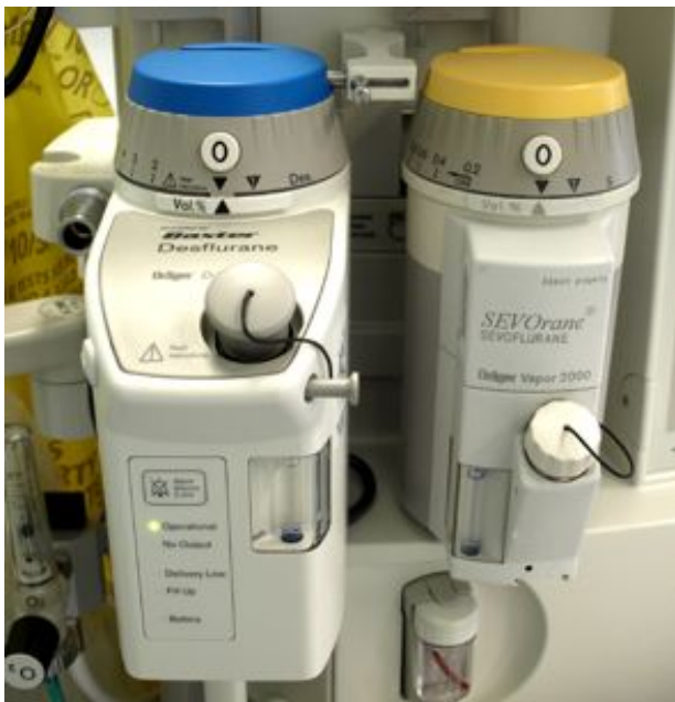
Figure 6. Desflurane (left) and sevoflurane (right) vapourisers.

The temperature compensation and safety features combine to make the Tec series of vapourisers reliable and safe. They are consequently the most commonly used vapourisers in anaesthetic practice.