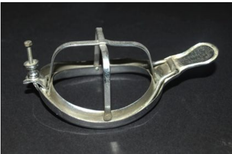
Figure 3. The Schimmelbusch Mask

Designed in 1890 by Carl Schimmelbusch, this hinge-framed mask holds a piece of lint or cloth. Ether or chloroform is dropped onto the material and the mask held onto the patient's face. The anaesthetic evaporates and is drawn through the material and inhaled by the patient. The depth of anaesthesia could easily be altered by changing the rate at which the liquid anaesthetic is dropped onto the mask, or lifting the mask from the patient's face.