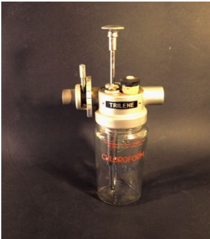
Figure 4. Boyle’s bottle

The Boyles bottle is another early example of a plenum type vapouriser. Fresh gas enters the vapouriser, and passes either straight through a bypass channel, where it does not come in to contact with anaesthetic vapour, or it passes into the vapourisation chamber which is filled with anaesthetic liquid. A plunger and cowl arrangement are used to increase the contact of the carrier gas with the surface of the anaesthetic, or even force the gas to bubble through the volatile. This increases the saturation of the carrier gas in the vapourisation chamber, and hence the vapour can be delivered at a pressure close to its SVP.