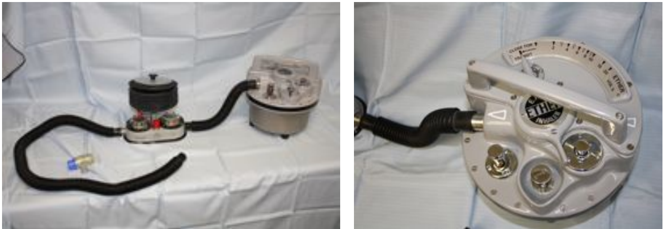
Figure 7. EMO and bellows