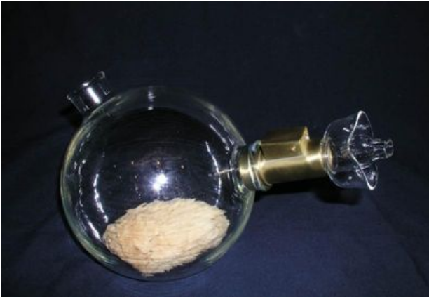
Figure 2. Morton's ether vapouriser

On October 16, 1846 at the Massachusetts General Hospital in America, William Morton gave the first public demonstration of anaesthesia using diethyl ether. He used a device of his own making consisting of a glass bulb with two orifices and containing sponges soaked in ether (fig 2.). One of the orifices was a mouth-piece through which the patient breathed in ether vapour, while at the same time drawing in air through the other. As the air passed over the sponges, more ether vapourises maintaining a steady supply of anaesthetic to the patient. Fortunately the low boiling point of ether means that vapour is produced quickly and at a sufficient concentration to maintain anaesthesia.