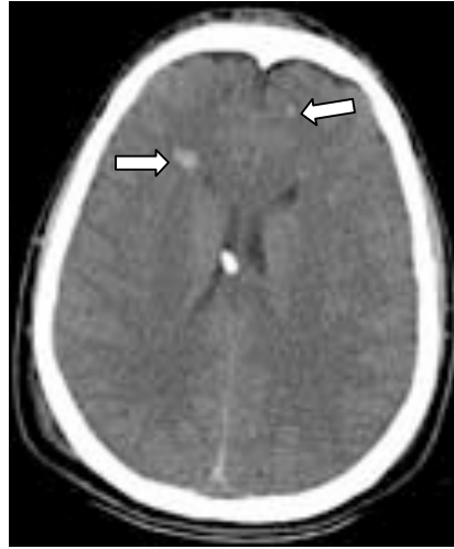
Figure 4: CT scan showing diffuse axonal injury with frontal petechial haemorrhages (arrows)

This is the primary lesion in around 40-50% of severe head injuries, and is secondary to shearing and tensile forces. The prognosis is linked to the clinical cause, with a prolonged coma suggesting severe, irretrievable injury.