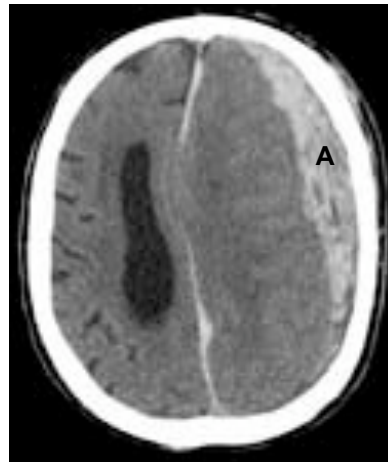
Figure 1: CT scan showing large left fronto-parietal subdural haematoma (A), with midline shift and compression of the left lateral ventricle.

This type of injury is often caused following forceful acceleration-deceleration events. Blood is seen on CT between the dura and the brain. Rapid neurosurgical intervention is often required, necessitating rapid transfer. On CT scan the border of the haematoma next to brain tissue is typically concave towards the midline.