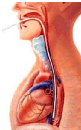
Figure 1. Oesophageal Doppler Probe Placement reproduced from Deltex Medical CardioQ ® manual

The probe is rotated until the transducer faces the descending aorta (the oesophagus and descending aorta run close and parallel to each other) and a characteristic waveform is seen.